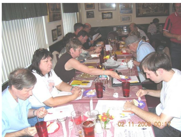
Members enjoy cake at the 33rd Fall Gathering.