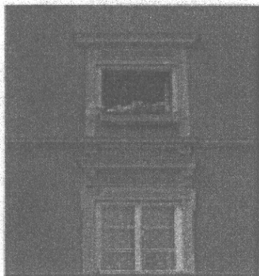
City Ablaze -2001/2004-

Another Exciting Sherlockian Round-Robin Pastiche by Members of The Pleasant Places of Florida