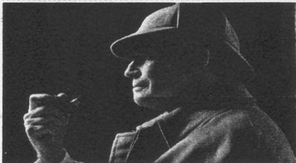
CHARLTON HESTON AS SHERLOCK HOLMES