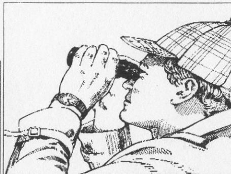
A page from The Mystery Anti-Coloring Book by Susan Striker copyright 1991.