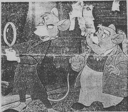
Basil of Baker Street and his assistant, Dawson